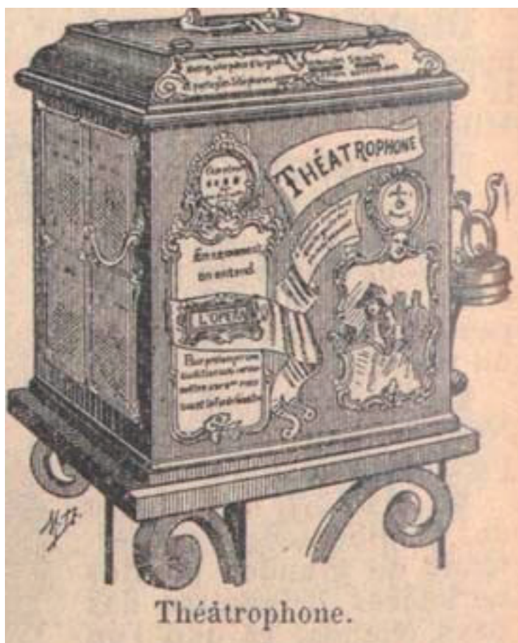
Figure 3: Marinovitch and Szarvardy's portable théâtrephone model, circa 1889.

One saw them [théâtrephone users], after having slid their fifty-cent coin into the opening, listen with beatitude at a selection of Miss Helyett , at a duet of The Venus Family , at a choir of Sigurd . (O'Monroy, 1892, p. 95) 8