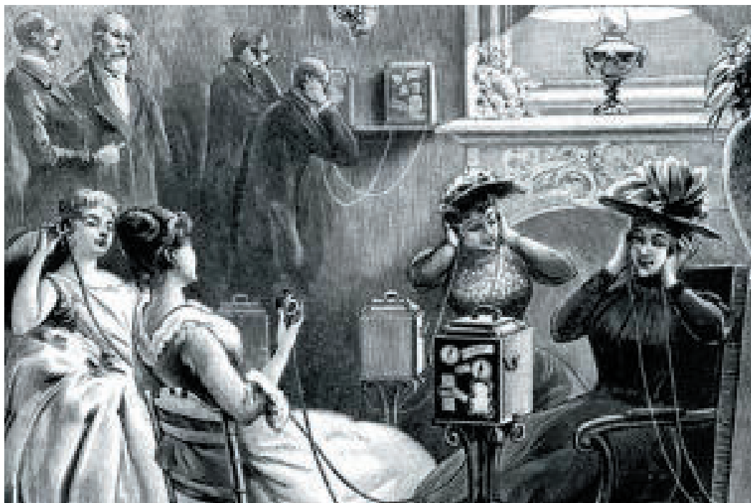
Figure 4. Portable theatrophone installed in a public space allowing for different listening configurations.

What is striking in O'Monroy's story is the figuration of modern acousmatic media. The way in which listeners were arranged around the théâtrophone, separated from one another, was important for learning how to engage with the sonically constructed environment. Considering the date, for many, Ader's 1881 telephone auditions would have been an initiatory experience of transduced sound. Referring to Figure 1 above, listeners entered a dimmed room and were instructed to stand at individual listening posts mounted along the wall. Facing the wall, they raised transducteurs to their ears and listened in (E.H., 1881). Visual contact was broken through turned backs, and gazes were directed at the machine. With Marinovitch