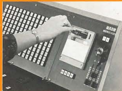
600 lighting cues recorded on one side of a mini-cassette