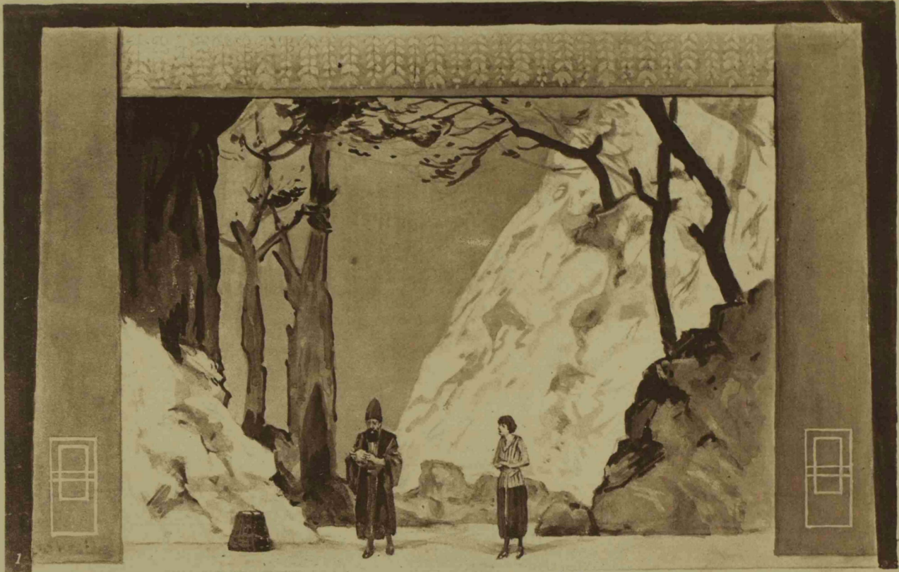
First Scene — The Valley of Echoes.

DRAWN BY OUR SPECIAL ARTIST, CECIL KING.