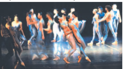
Light - Ballet of XXe century