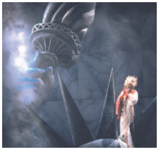
Caligula - National Theatre of Belgium