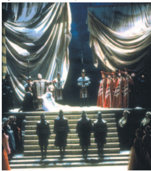
Bocca Negra - Royal Opera of Wallonie